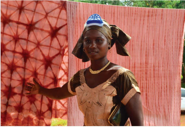
Ponte Nova Women's Association who returned from Gambia.

household income of this area on different levels (Unimos and Divutec 2011). Widespread illiteracy, very low-income level, and gender-based violence put women in the Bafata region in an extreme situation of defeat. In theory it is the husband who rules, yet in practice the women also have to contribute to household life and the extremely low development leaves them desperately seeking other sources of income to pay for resources to ensure education for children so that they do not have to work and can attend school.